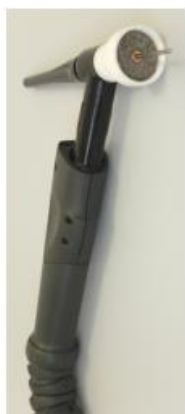
SR17, SR18, SR26, TL18